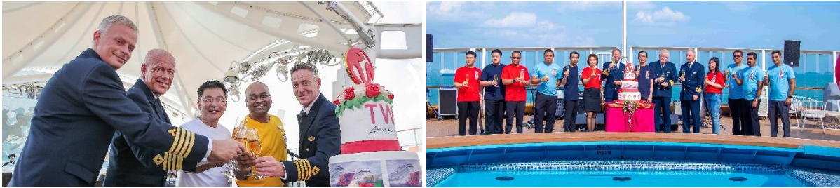
23 June 2024 (Sun): Resorts World Cruises celebrates its 2 nd Anniversary with a special 'Open House' event on the flagship, Genting Dream and Resorts World One in Singapore.

24 June 2024 (Singapore) – Resorts World Cruises held a special 'Open House' event on 23 June 2024 (Sunday) in Singapore on both its cruise ships, the Genting Dream and Resorts World One to celebrate its 2 nd ANNIVERSARY. The event was opened to the public for registration and the response was overwhelming with close to 1,000 attendees, which also included business and travel partners, the local authorities and members of the regional media. Registered guests had the chance to be part of the ships' double celebration with the exciting opportunity to experience first-hand the charm and unique features of each ship. These include interacting with the ship's friendly crew members with special previews of the onboard facilities, accommodations, entertainment and offerings, including sampling a variety of delicious food and beverages.