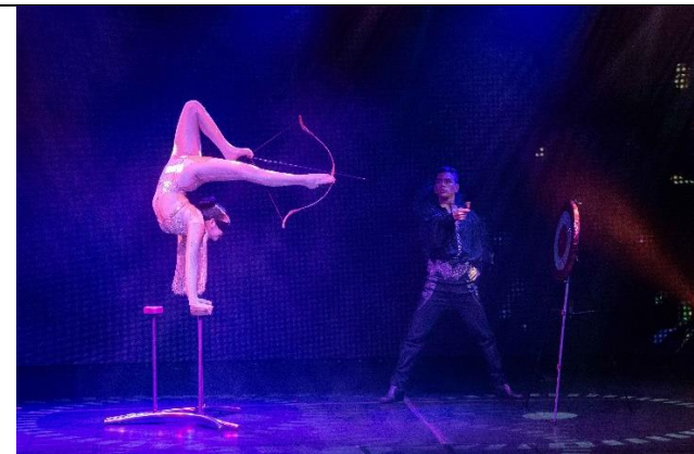
Exclusive and exciting performances at the Zodiac Theatre aboard the Star Voyager.