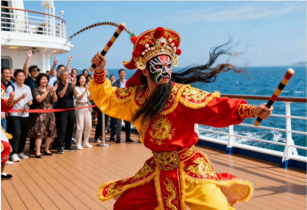
5 – 10 October 2025 Sailing: Festive vibes aboard the Star Voyager with the vibrant Mid-Autumn "Yingge Dance at Sea" performance.

10 October 2025 (Hong Kong) - StarCruises brought tradition to life this Mid-Autumn season with the vibrant " Yingge Dance at Sea " voyage aboard the Star Voyager . Departing from Hong Kong on 5 October 2025 for a 5 Night Nha Trang – Da Nang – Sanya Cruise, the special sailing blended the energy of Chaoshan's " Yingge Dance " - a national cultural heritage of China - with festive Mid-Autumn celebrations, offering guests a fun and culturally immersive experience at sea.