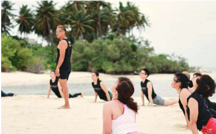
Bersenam, bercuti dan bersantai! Sertai StarCruises x Under Armour untuk “Fitness @ Sea” di atas kapal persiaran Star Voyager , 19–23 Jan 2026, berlepas dari Pelabuhan Klang.

19 – 23 Januari 2026: Pelayaran gaya hidup aktif 4 Malam dari Pelabuhan Klang ke Phuket dan Singapura, menggabungkan senaman dan relaksasi.